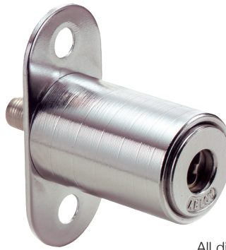
All dimensions shown are in the locked position.