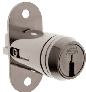
Pat. Pending All dimensions shown are in the locked position.