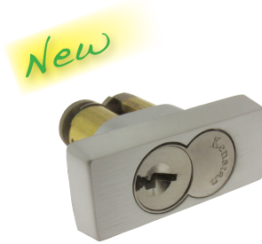
TRACK MOUNT (Plunger travels 1/2")

*Cores are not included with this lock. See page I14 to order or view cores.